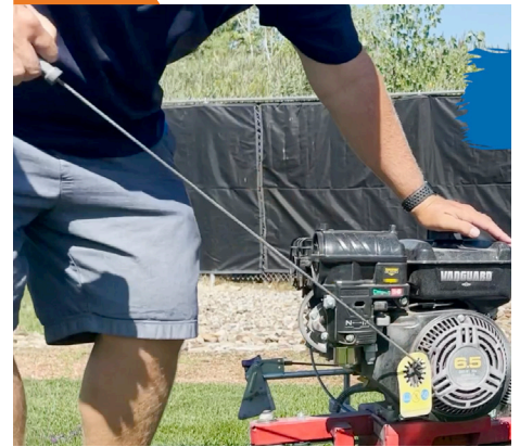
Start your engine.