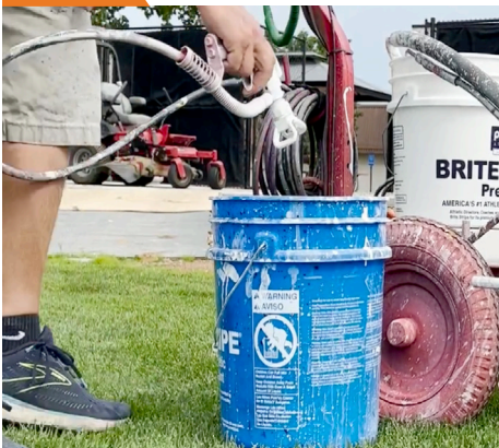
Prime the machine.