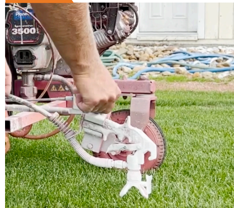
Lock gun into place.