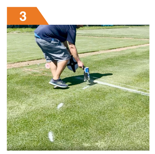
Using aerosol paint, dot out the full path of your circle.