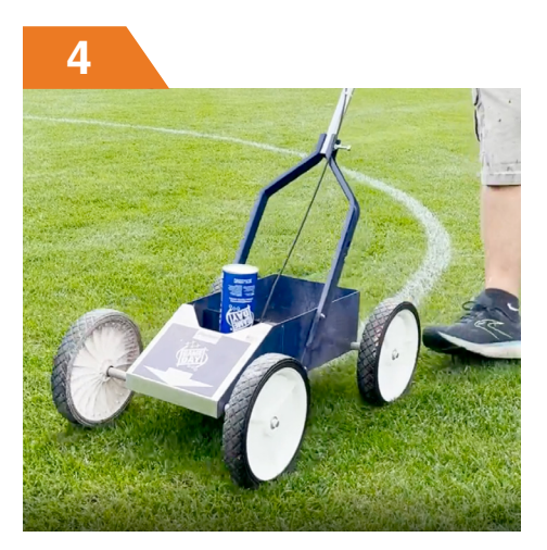
Paint along the outer edge, using the dots as a reference.