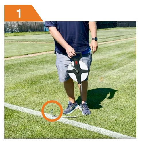
Find center spot of circle.